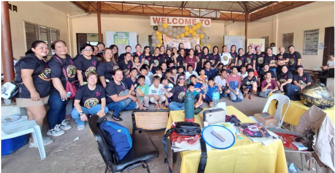
RC South Davao sponsored the Girl's Mixed Riders Club charity event last July 7, 2024.