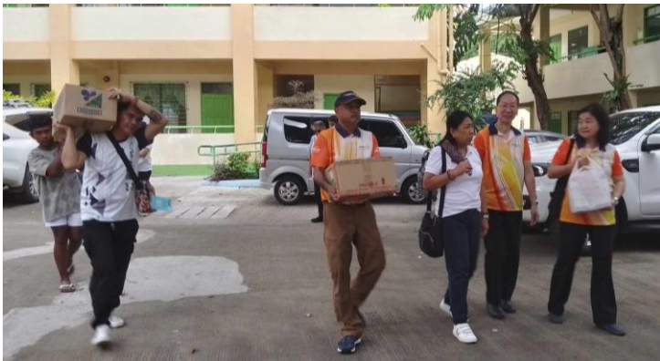
Turnover of relief goods & medicines to the fire victims of Brgy. 20A in partnership with RC Davao, RC Davao 2000, RC Matina Davao and RC West Davao. July 19, 2024, Magallanes Elem. School.