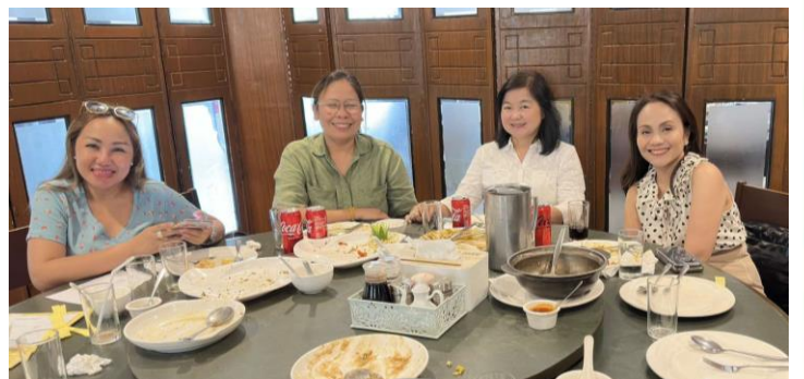
Lunch meeting fellowship at Ahfat Restaurant, July 24, 2024